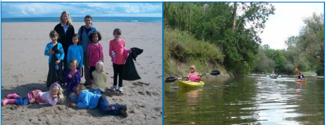
Above: A Girl Scout troop poses after a morning of cleaning up trash along the Sheboygan beach. Participants of a kayak expedition enjoy the scenery as they make their way down the Sheboygan River.

These events have allowed the public to get involved and gain an understanding of why the Sheboygan River is considered one of the 43 most areas in the Great Lakes drainage basin needing special attention and what we can do to help restore its health. Most importantly, these events have sparked the interest of the community and shown participants why the health of the Sheboygan River is important.