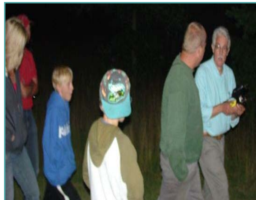
On August 10th, 30 people learned about night-time bat surveys being done on the Sheboygan River to assess its ecological health.