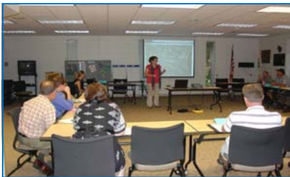
Above: CAC habitat presentation-The Sheboygan River Community Advisory Committee started meeting in August.