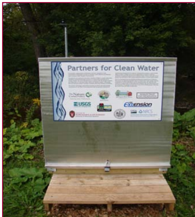
Above: USGS Monitoring Station at Fischer Creek.

The work being done in the Sheboygan River Basin is part of a larger effort by TNC to develop farming strategies that are friendly to the environment. Similar efforts are taking place throughout the Midwest. Targeting cost share funding to those fields losing the most phosphorus should be the most cost-effective means of improving water quality while sustaining a healthy agricultural economy. In the end, everyone wins!